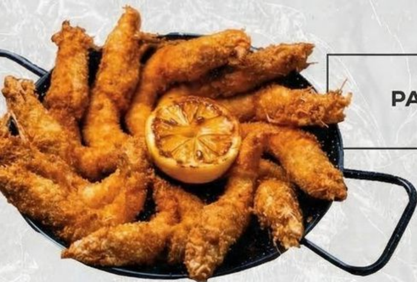
JUICY'S PANKO PRAWNS £26.50