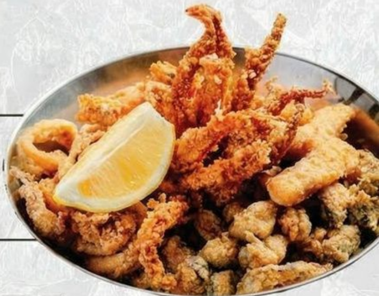
JUICY'S CRISPY BABY FISH £13.50

PLATTER FOR ONE PLATTER FOR 2 /3 £27.50 £55.00